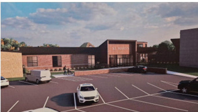
Rendering of the western front of the Parish Center

A: Parishioners of all ages are encouraged to consider making gifts of stock or securities to support our parish. For those ages seventy and a half or older, this giving offers unique benefits: 1) It allows you to make a meaningful contribution without paying capital gains tax and 2) It enables the parish to receive a potentially larger gift. This is a wonderful way for everyone to benefit—both you and our parish community!